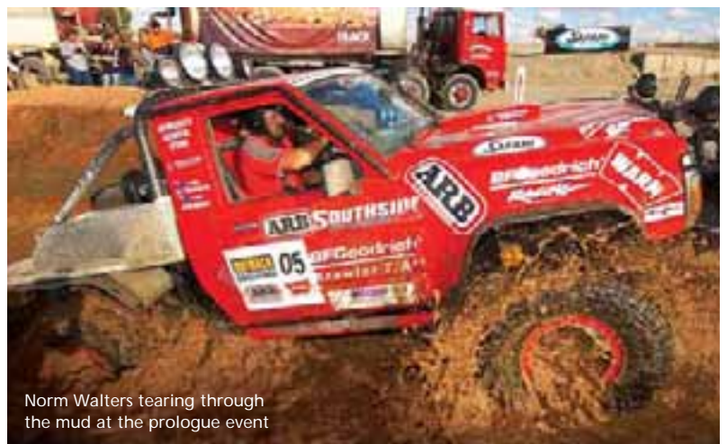
Norm Walters tearing through the mud at the plouge event